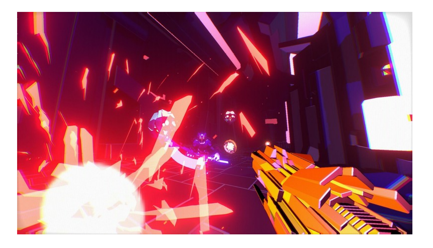
DESYNC: The Original Soundtrack - Volume 1 (Daniel Deluxe) Crack Code Activation

Download >>> <a href="http://bit.ly/2SIRExK">http://bit.ly/2SIRExK</a>